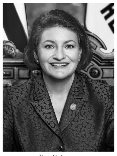
Toni\,G.\,Atkins president pro tempore of the senate