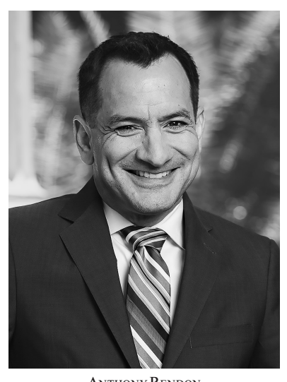
\begin{array}{c} A \text{NTHONY} \, R \text{ENDON} \\ \text{SPEAKER} \, \text{OF} \, \text{THE} \, \text{ASSEMBLY} \end{array}