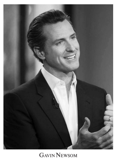
GAVIN NEWSOM GOVERNOR OF CALIFORNIA