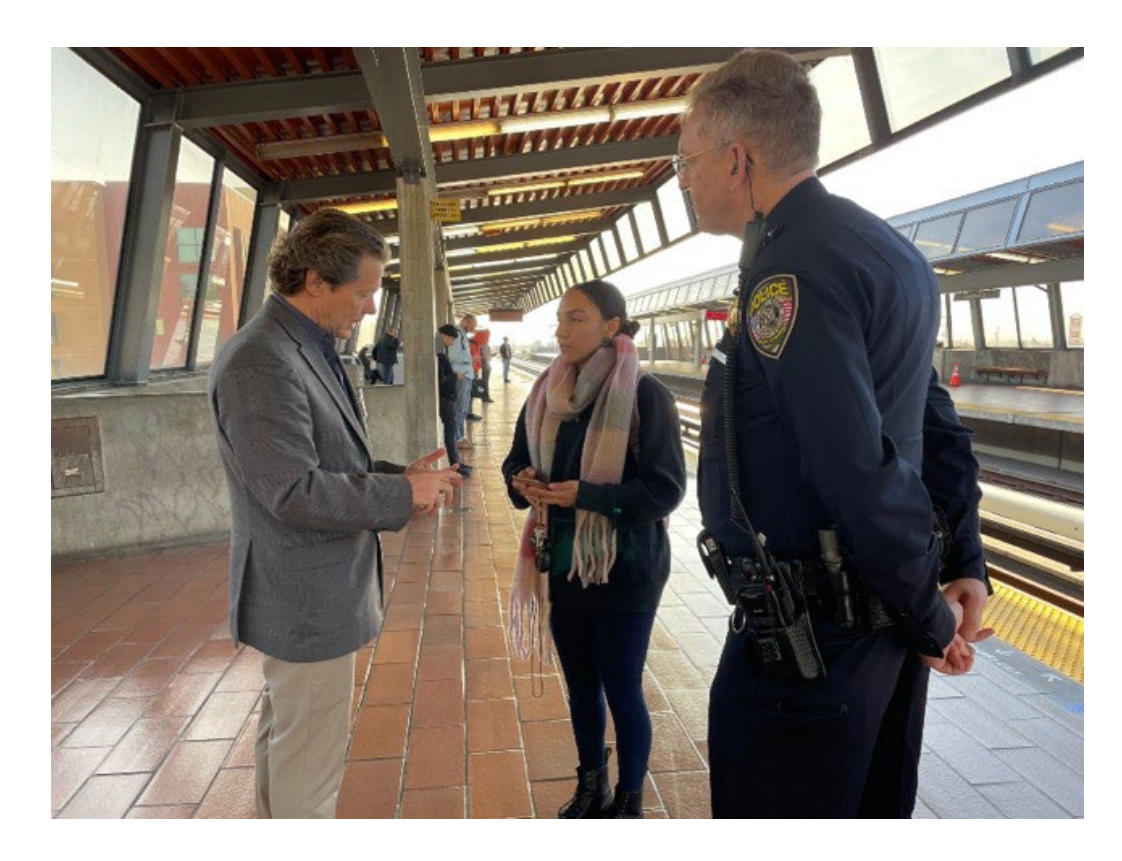
General Manager and Chief of Police Listening Tour at Fruitvale Station